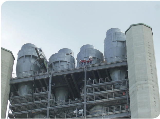
Above: Project in Germany: Wear-resistant lining of cyclone with SC-WearStop®.